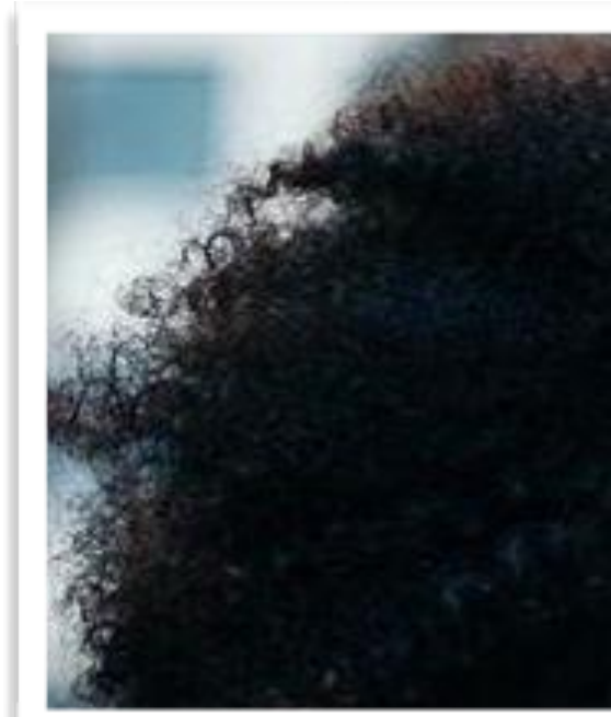
Loose Coils Zigzag