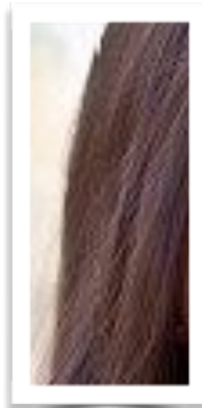
No Bend/ Slight Bend