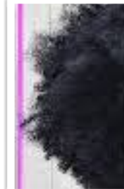
Tight Coils Zigzag